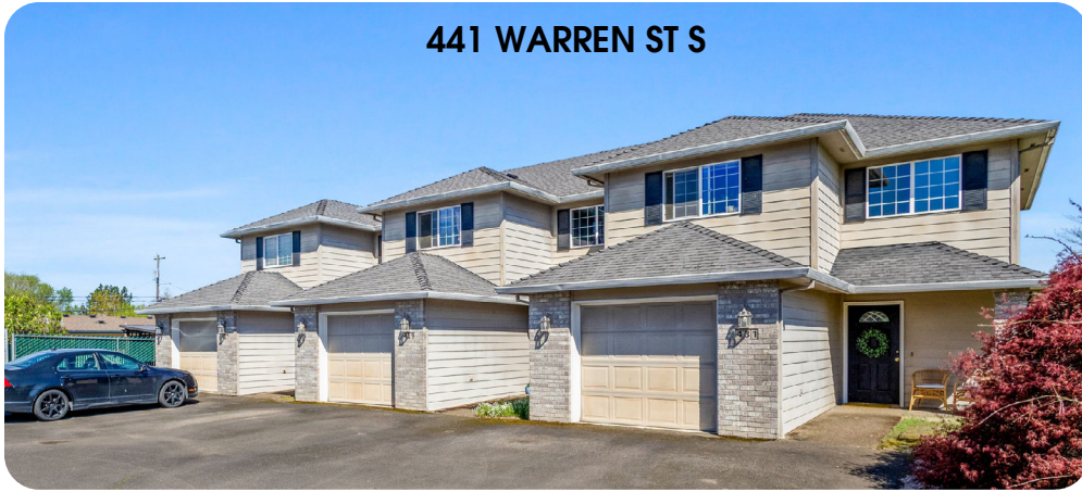
441 WARREN ST S