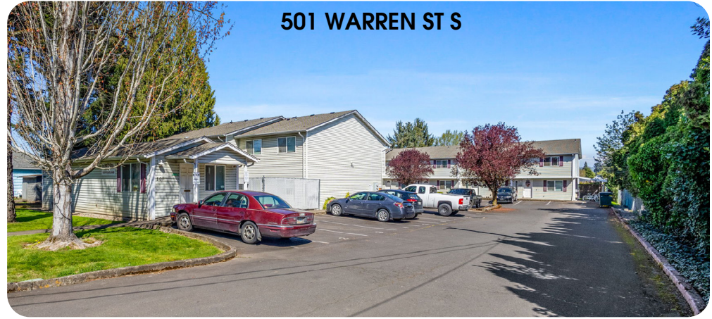
501 WARREN ST S