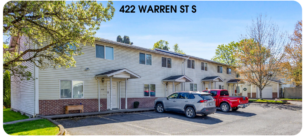
422 WARREN ST S