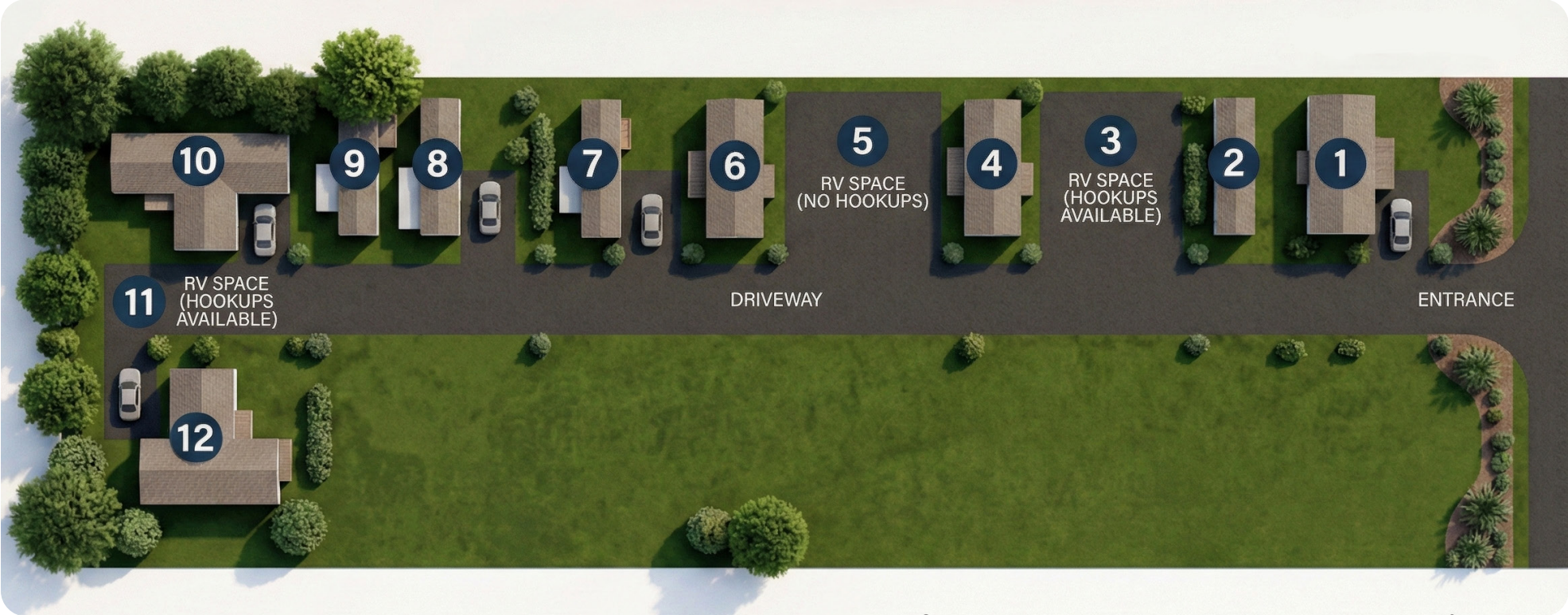
Site plan not to scale and represents the general layout of the property