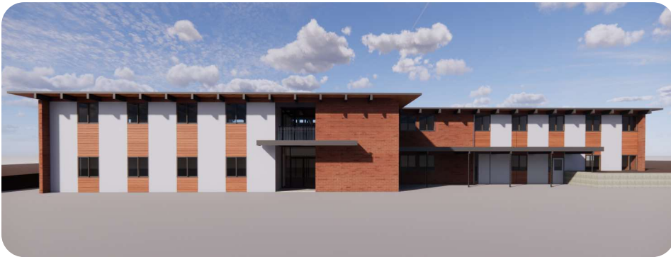
Sample rendering of potential renovation